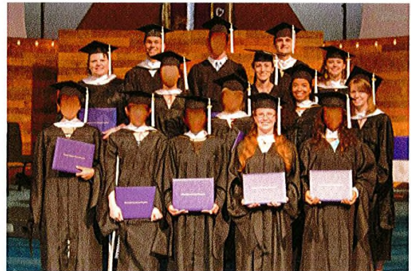
Part of GIAL's graduating class of 2017. Some faces are blurred due to privacy issues—many of our graduates serve in sensitive locations.

The Graduate Institute of Applied Linguistics received a generous grant from the Hillcrest Foundation to upgrade their computer lab. (Their previous computers had been purchased in 2010.) GIAL is actively involved in training the next generation of cross-cultural workers to serve with Wycliffe Bible Translators and other mission organizations. GIAL alumni have already completed 21 New Testaments in Africa, Asia, Central and South America, and the south Pacific islands. Glenna enjoys serving at the GIAL library.