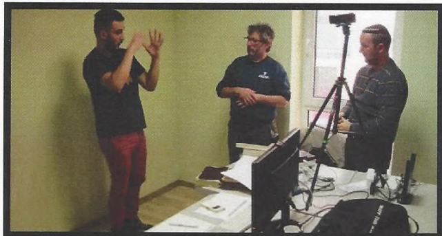
Recording Scripture in Romanian Sign Language