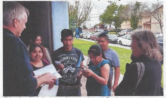
Distributing the newly translated Scriptures to speakers of SVC Zapotec in California