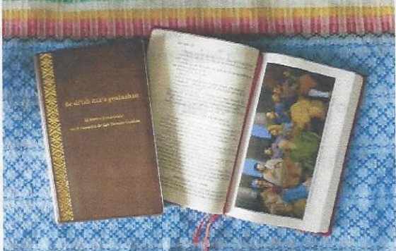
The New Testament in San Vicente Coatlan Zapotec