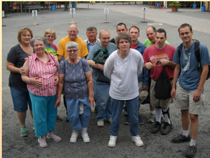
Slate Hill Volunteers with Cumberland Vista at Knoebels, Aug. 2017