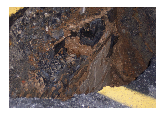
Exposed wall between the two cellars