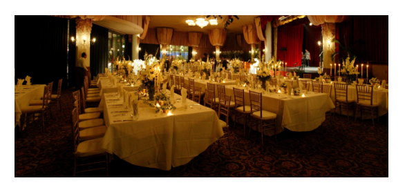
FRIENDS OF SHIRATI

It's almost time for the annual Friends of Shirati banquet! Learn about a ministry of the Tanzania Mennonite Church located on the shores of Lake Victoria, and catch a vision of how you can be involved in supporting wholeness of life for those in that community. Friends of Shirati, a nonprofit supporting medical and educational work in Tanzania, will hold its banquet on Saturday, March 10, at 6:00 pm at the Gathering Place in Mount Joy, Pennsylvania.