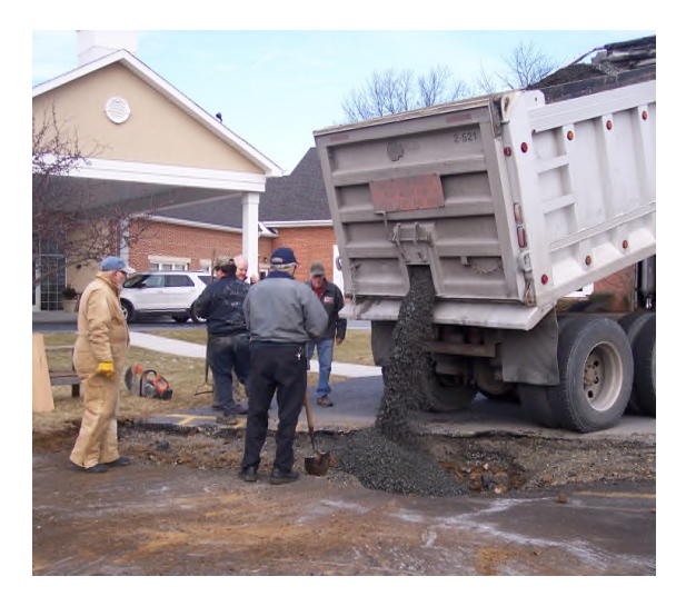
Filling the void.