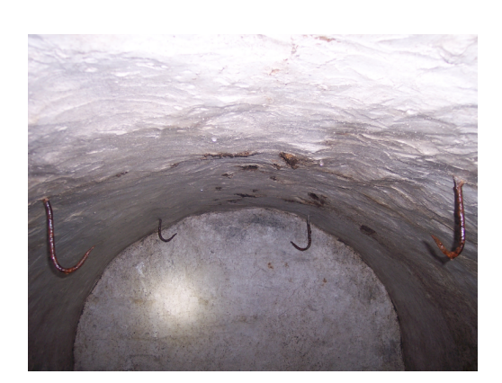
Back wall and rusted meat hooks in arched ceiling of lower cellar.