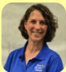
Mechanicsburg Center Manager